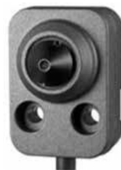
IP Camera (Actual size)