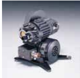
Auxiliary Air Compressor