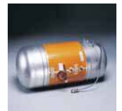
Heated Storage Tank with Blanket Heater