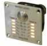
Potable Water System Controller