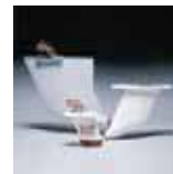
Heated Drain Masts